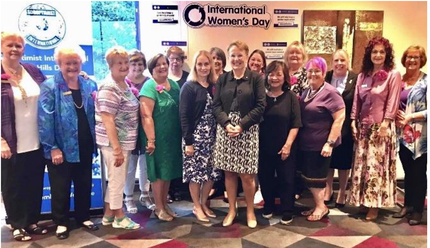
Soroptimist International of The Hills District

A reminder to send in your work as soon as you have completed it. The Programme team love hearing and promoting club's advocacy and project work. It also helps provide ideas to other clubs in the Federation.