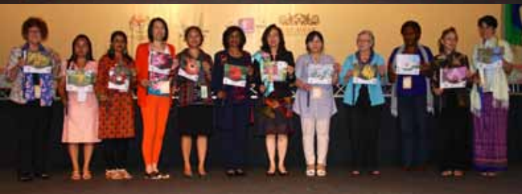
2012-2014 Biennium Team of MC, Board, NRs, Convenors and Appointees