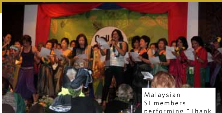
Malaysian SI members performing "Thank You Soroptimists" at the Friendship Night

As only 350 members attended the 19th SISWP Conference of Clubs, 2-4 May 2014 in Kuching, Malaysia, I would like to take this opportunity to thank all the members of SISWP for having given me the unique honour to serve as your President from May 2012 to April 2014 and to thank you for your kind support. For those of you who were unable to attend the CoC, I would like to report that the conference was positively responded to by the delegates.