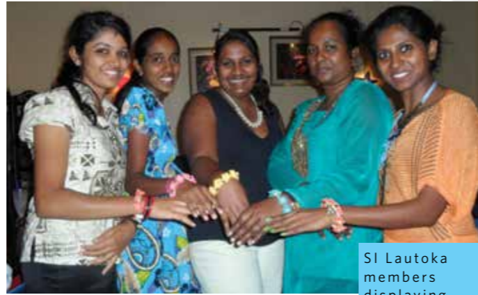
SI Lautoka members displaying their lovely friendship bracelets.