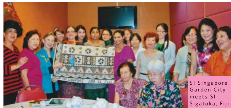
SI Singapore Garden City meets SI Sigatoka, Fiji.