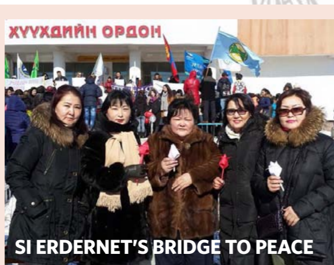
SI ERDNET'S BRIDGE TO PEACE

To mark International Women's Day on 8 March 2015, SI Erdnet, Mongolia, participated in a parade with the theme "Empowered Women Are the Bridge to Peace". Soroptimists joined in the walk with students from youth clubs, colleges and universities inviting all to join women on the bridge. The parade also conveyed the message that women and the community must speak up against domestic violence. SI members are holding little roses made by children as symbols of peace.